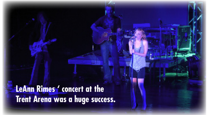
LeAnn Rimes' concert at the Trent Arena was a huge success.

The Kettering Education Foundation was established to create opportunities for interested citizens, organizations, and businesses to enhance the educational opportunities in the Kettering school system. Contributions are sought from supporters of education and used to fund a grants program supporting curriculum-based programs and innovative teaching.